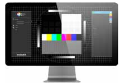
Pictured above: Adder DVA calibration software as part of the Virtual Control App

Adder DVA is supplied with a Virtual Control Panel (VCP) app which allows brightness, tone and sharpness to be adjusted. Vertical and horizontal video alignment can also be adjusted, where necessary. The VCP app contains a test pattern to accurately display the changes. EDID management options can also be changed and the EDID's of the monitors can be displayed.